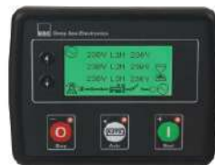
DSE4510 MKII AUTO START & AUTO MAINS FAILURE CONTROL