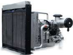
PERKINS Engine 4006C-23TAG3A