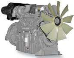
PERKINS Engine 2806A-E18TAG1A