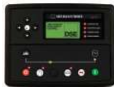
DSE7320 MKII AUTO START & AUTO MAINS