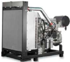
PERKINS Engine 2206A/C-E13TAG3