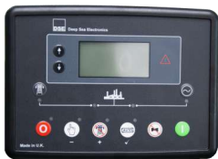
DSE7110MKII AUTO START & AUTO MAINS FAILURE CONTROL