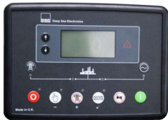
DSE7320 MKII AUTO START & AUTO MAINS FAILURE CONTROL