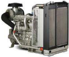
PERKINS Engine 1206A-E70TTAG3