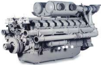
PERKINS Engine 4016TAG2A