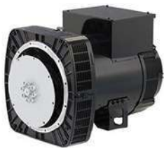
Leroy Somer LSA52.3 S6