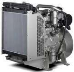
PERKINS Engine 1106A-70TAG2