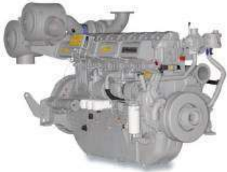
PERKINS Engine 4008-TAG2A