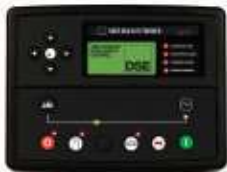
DSE7320 MKII AUTO START & AUTO MAINS