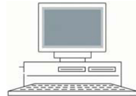
Control your generator remotely