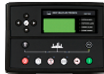
DSE 7420 Remote Control Panel