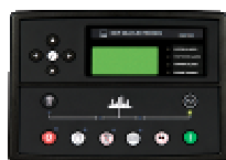
DSE 7420 Remote Control Panel