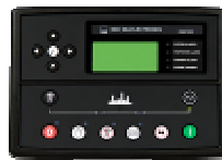
DSE-7320 Remote Control Panel