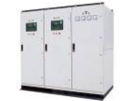
DSE-550 Parallel Control Panel system