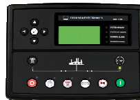
DSE-7320 Remote Control Panel