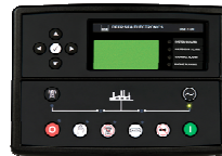
DSE-7320 Remote Control Panel