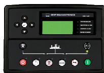
DSE-7320 Remote Control Panel