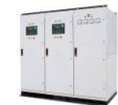
DSE-550 Parallel Control Panel system