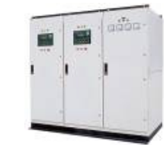
DSE-550 Parallel Control Panel system