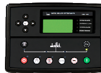
DSE-7320 Remote Control Panel