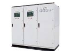
DSE-550 Parallel Control Panel system