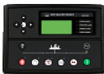
DSE-7320 Remote Control Panel